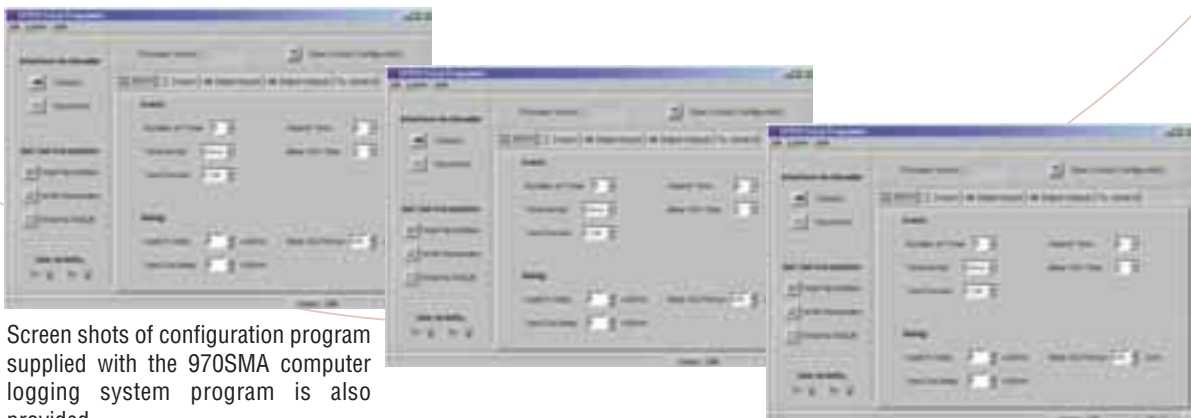
Screen shots of configuration program supplied with the 970SMA computer logging system program is also provided.